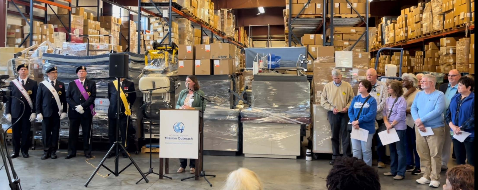
Local Knights of Columbus leadership, Mission Outreach team members and volunteers, Hospital Sisters of St. Francis, and the Springfield community gathered in April to bless a 40-foot container of medical supplies and equipment before shipping to Ukraine.