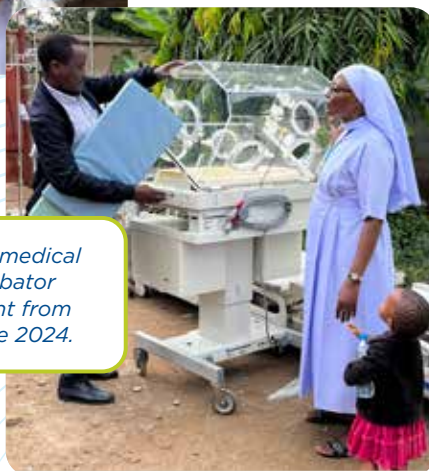
The St. Joseph Hospital medical director looks at an incubator that arrived in a shipment from Mission Outreach in June 2024.

For the next phase, Mission Outreach will help equip a new Women and Children’s Center under construction on the St. Joseph campus. We will be sending an estimated seven to nine additional 40’ containers of medical equipment, with support services to help the St. Joseph team procure items locally.