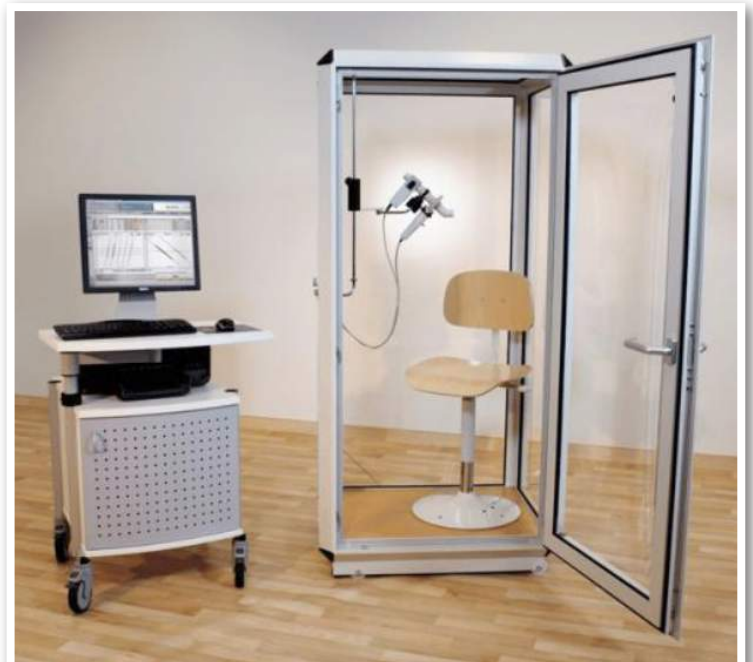
An inside look at the new pulmonary function test.

This month, the PFT system at HSHS St. Vincent Hospital Heart Center was upgraded. This equipment – funded 100% by generous people like you - provides patients with the hope and help they need. Thank you for making a difference!