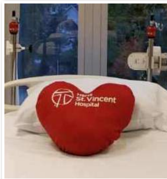
Heart pillow for surgery patients

The best part? No prescription is required for this pillow. And there is no hidden fee that will appear on a medical bill. The heart pillow is provided through your generosity and the wonderful sewing skills of our hospital volunteers. No matter how big or small, your support means we will be able to make a difference in patients' lives. Thank you!