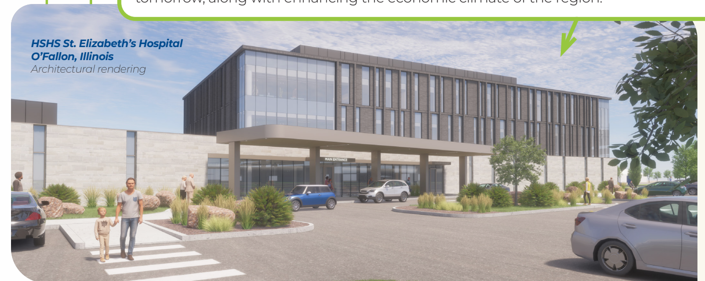
HSHS St. Elizabeth's Hospital O'Fallon, Illinois Architectural rendering

HSHS hospitals boost their state and local economies, offering high-paying jobs, job growth in other sectors and purchase power for community goods and services.