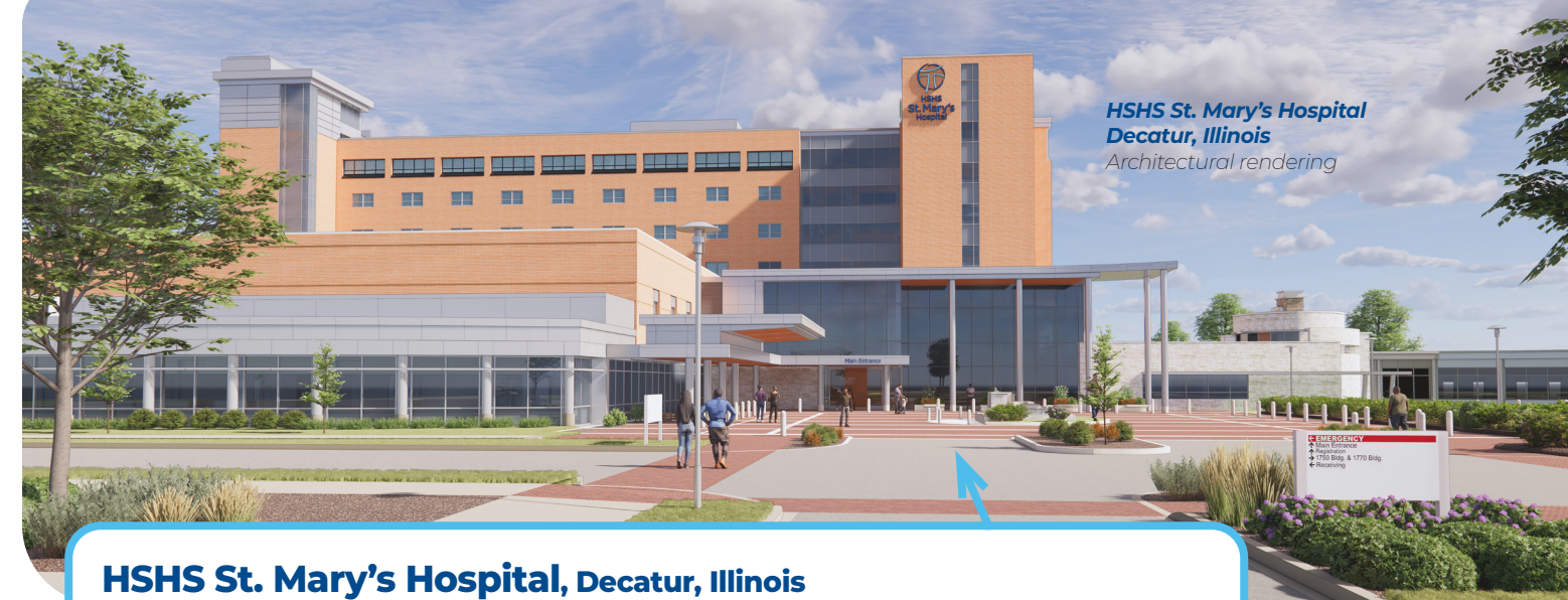
HSHS St. Mary's Hospital Decatur, Illinois Architectural rendering