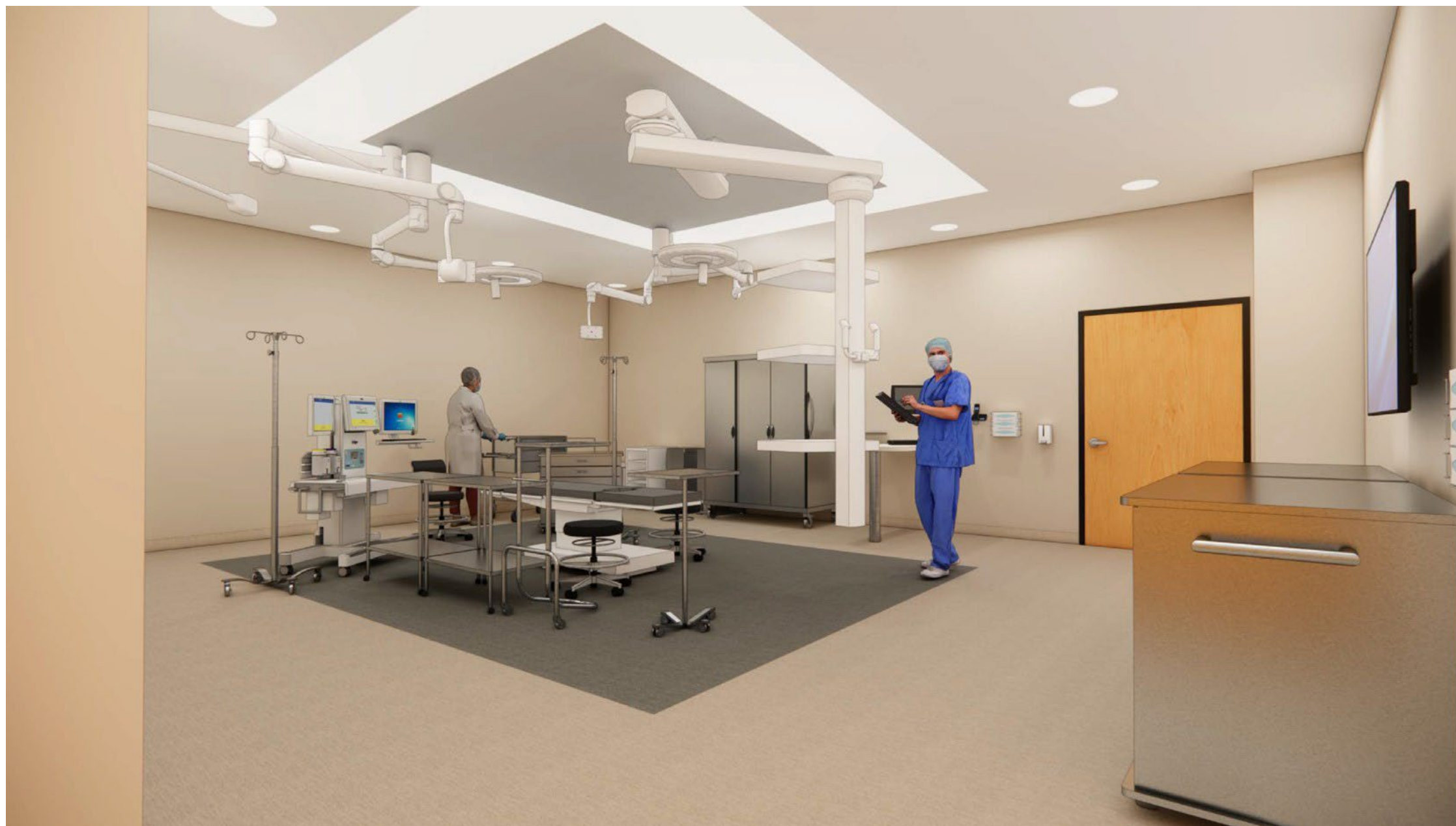
OR View 1