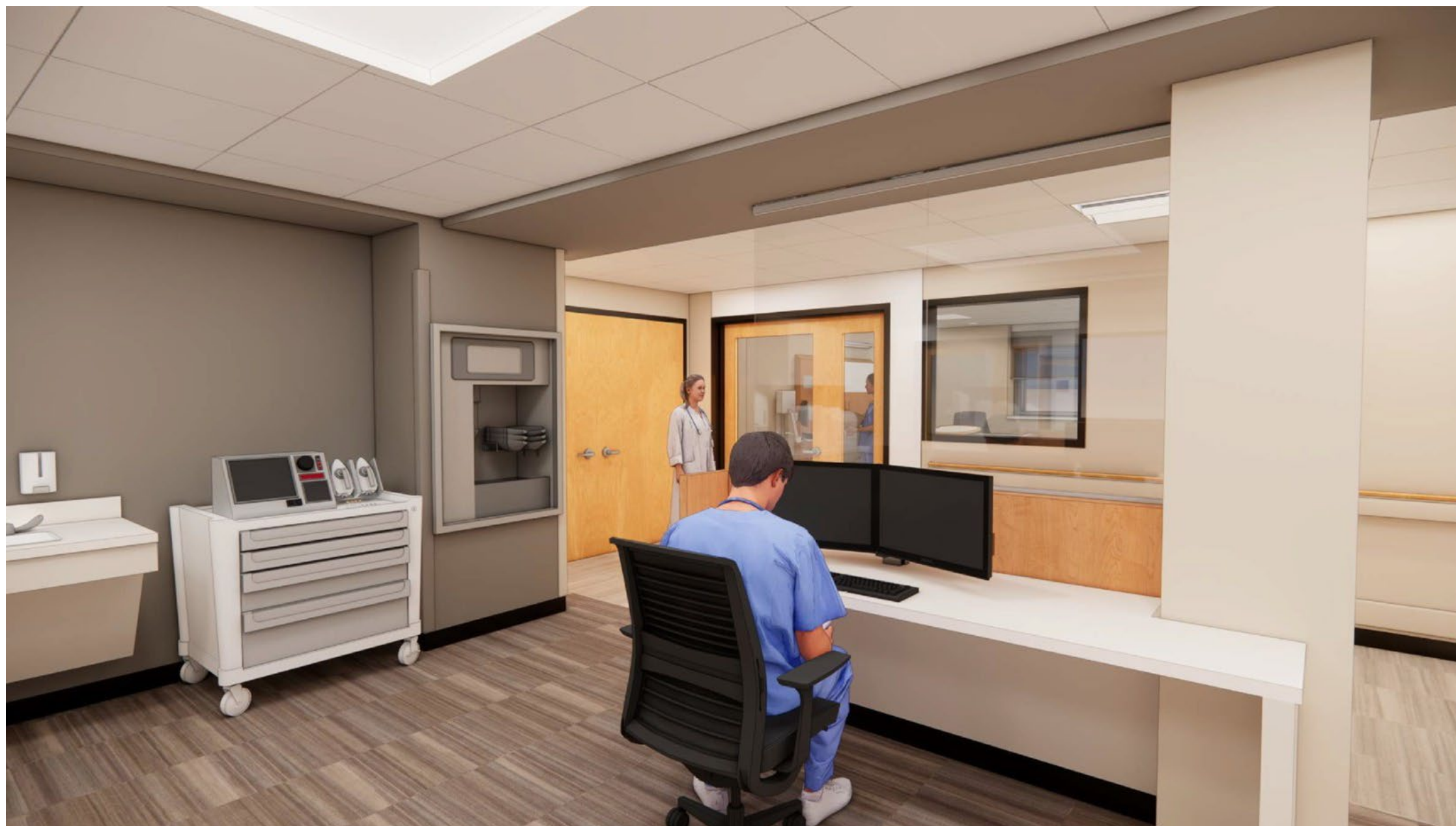
4 th Floor – Med/Surg, ICU Nurse Station