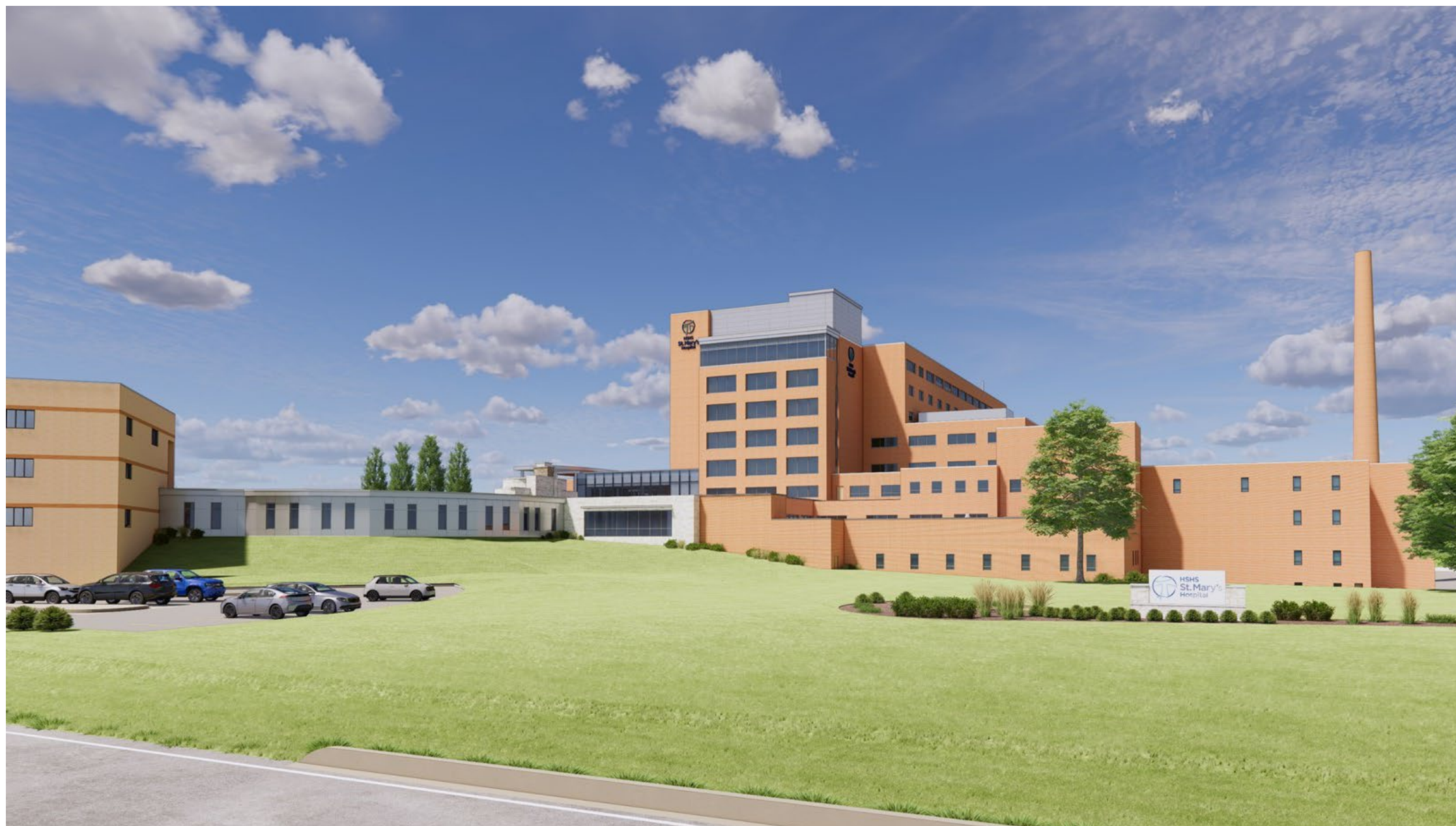
Lake Shore Drive View