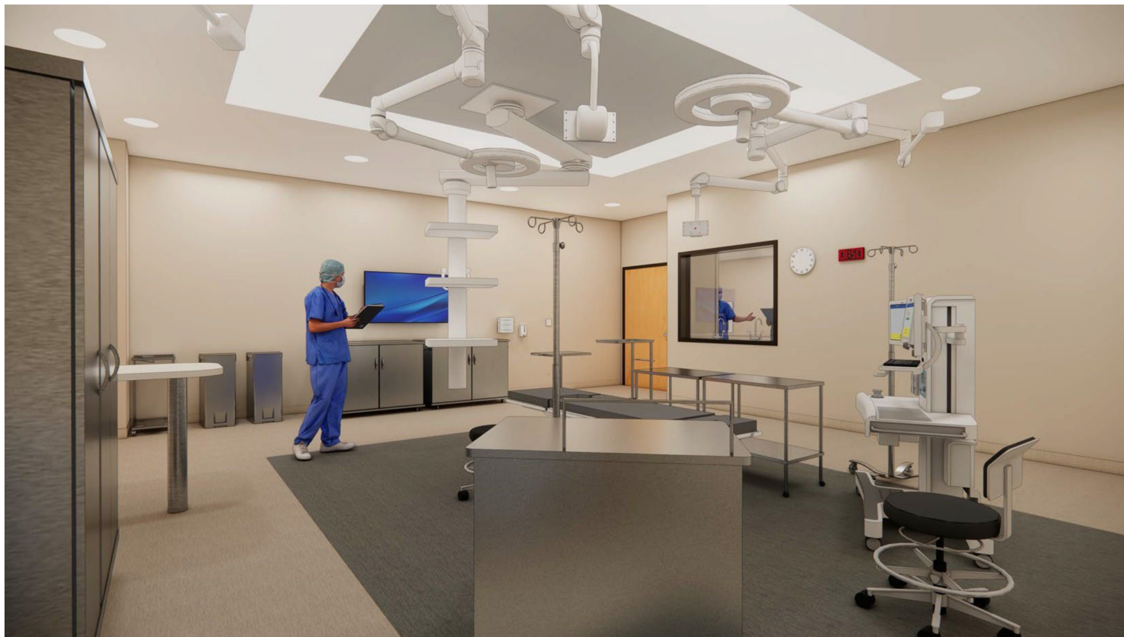
OR View 2