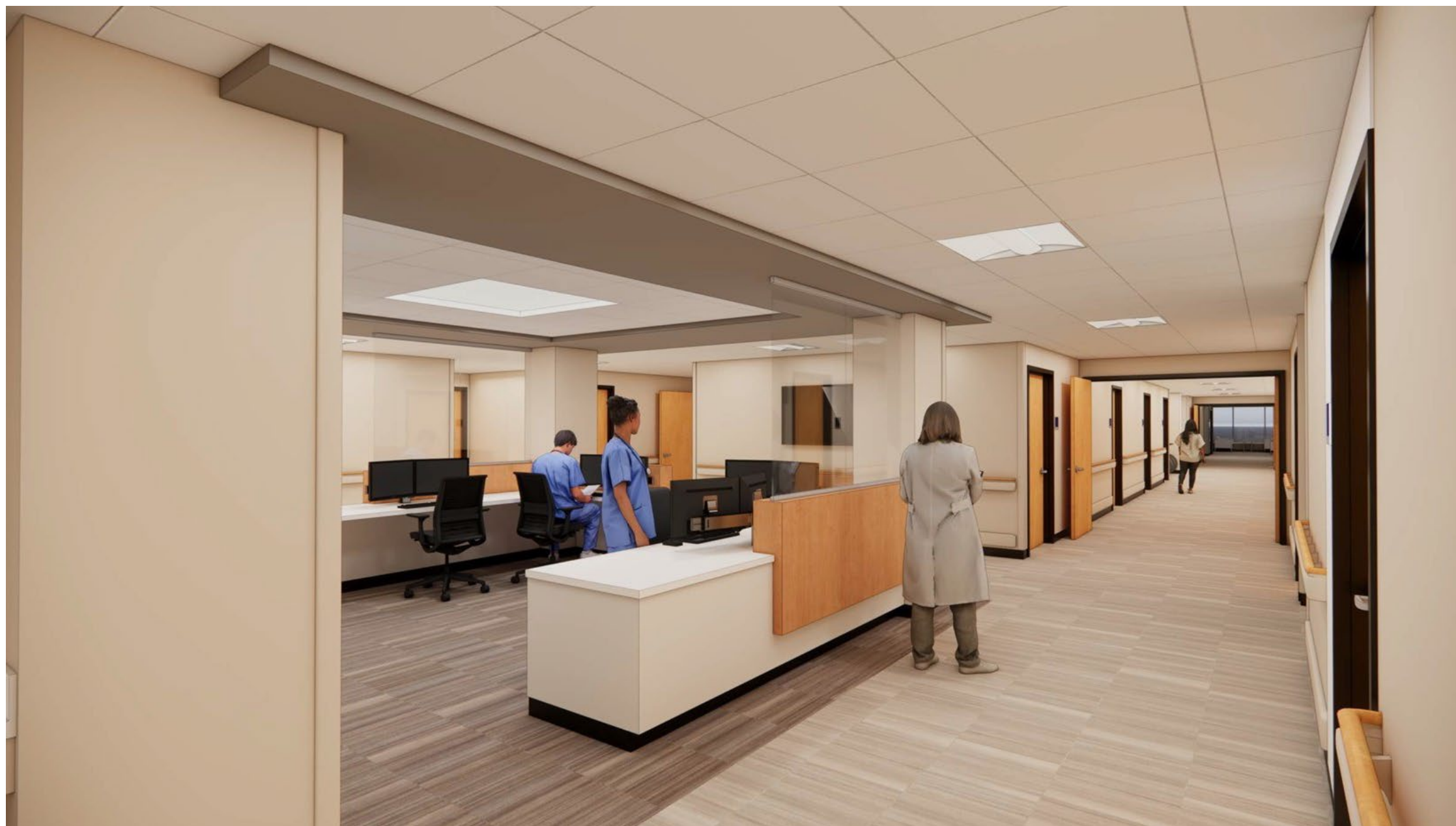
3 rd Floor – Med/Surg Main Nurse Station View 2