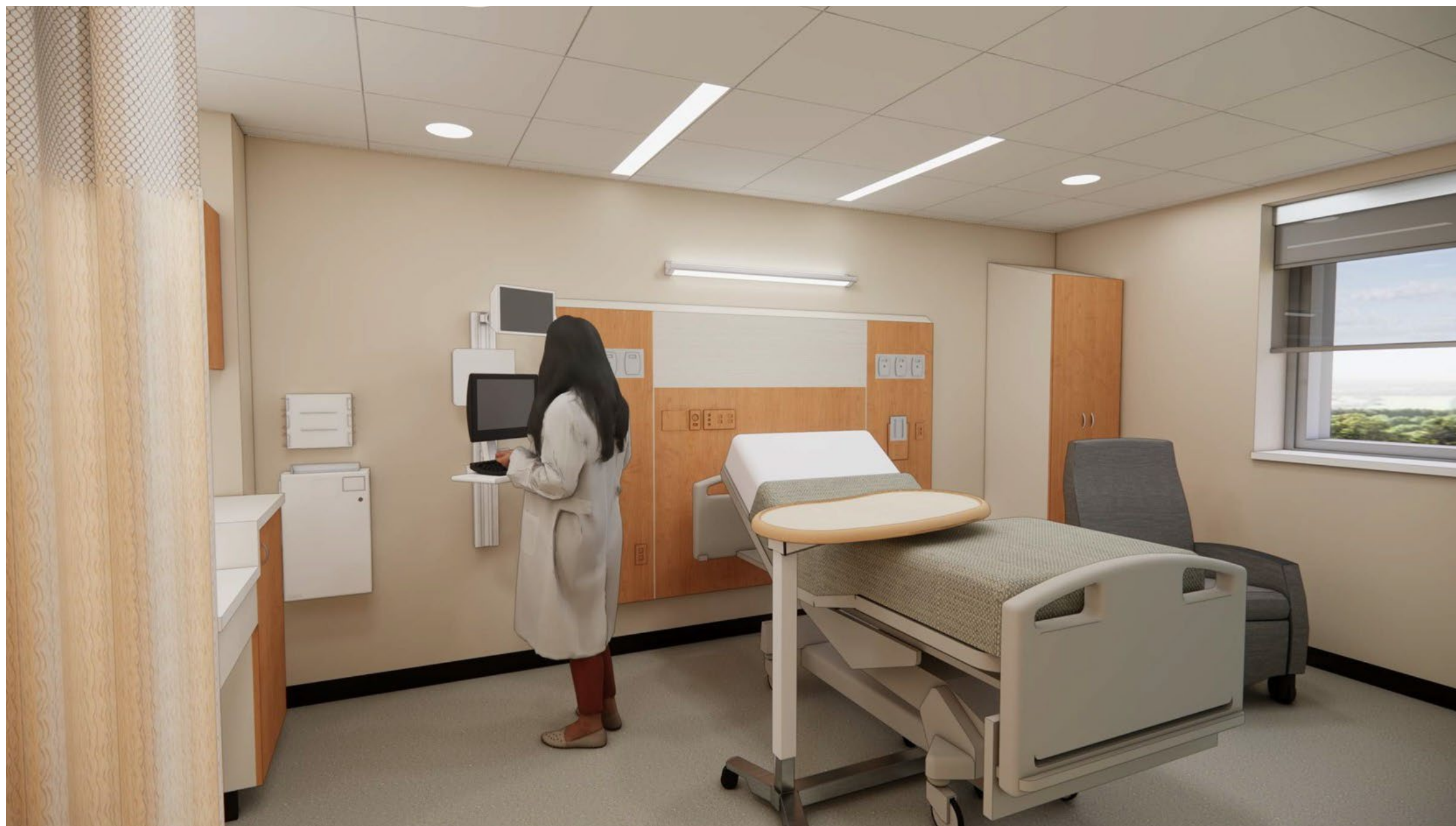
3 rd Floor – Med/Surg Patient Room View 2