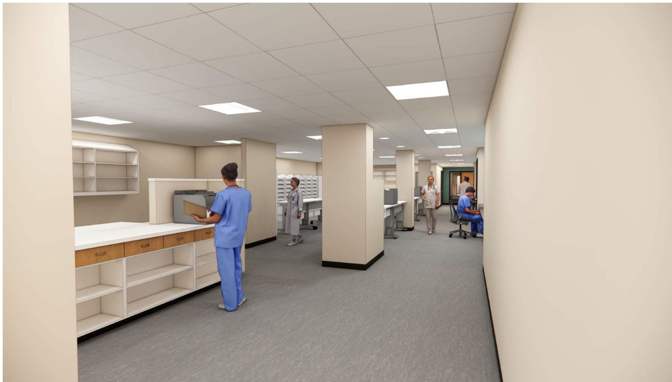
7 th Floor – Pharmacy View 2