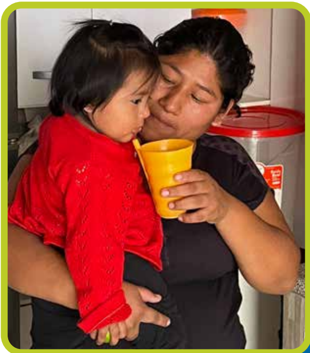
A mother in Trujillo, Peru, offers her daughter a drink of water from a purifier provided by Mission Outreach, Bon Secours Mercy Health, and the Hermanas de Bon Secours.