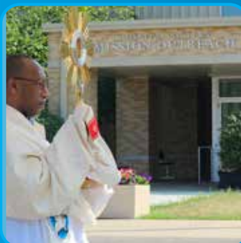
Mission Outreach was blessed to be included in the National Eucharistic Pilgrimage on Wednesday, July 10, 2024. The procession began near St. Francis of Assisi Church then traveled to the Hospital Sisters' chapel, the Franciscan Brothers' chapel, Mission Outreach, and then returned to St. Francis of Assisi Church.