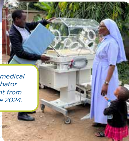
The St. Joseph Hospital medical director looks at an incubator that arrived in a shipment from Mission Outreach in June 2024.