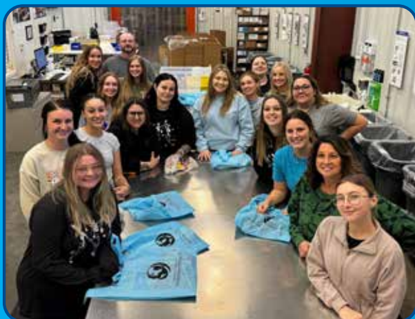
Students from the Lincoln Land Community College (LLCC) Radiography student club volunteered to help sort medical supply donations. Throughout 2024, Mission Outreach saved the LLCC Health Professions program approximately $125,000 by donating medical supplies that are not appropriate for international shipment but can be used for student training.