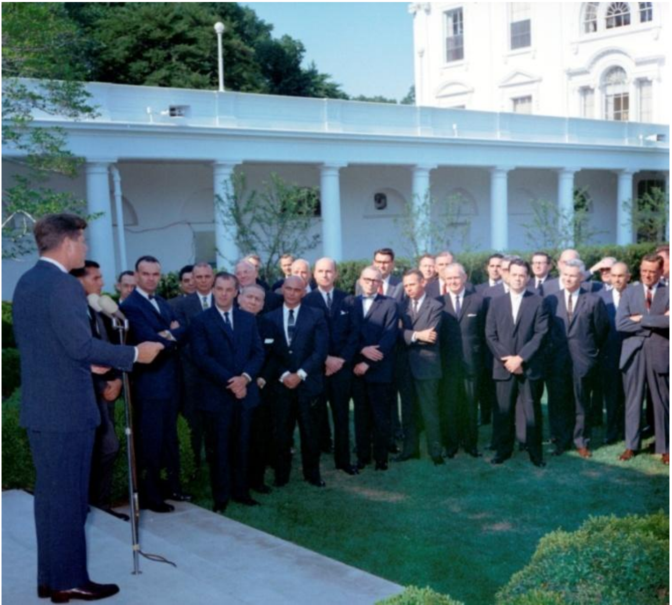
JFK speaks to USAID directors and deputy directors on the White House lawn, June 8, 1962.